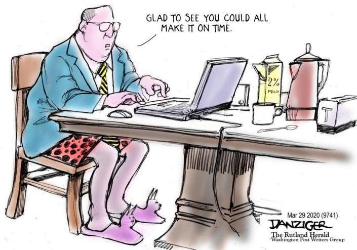
Early Zoom Meeting

To join in these social times, follow the link provided in the e-news. On the first Sunday of the month, our prayer time includes online Eucharist – have some bread and juice ready!