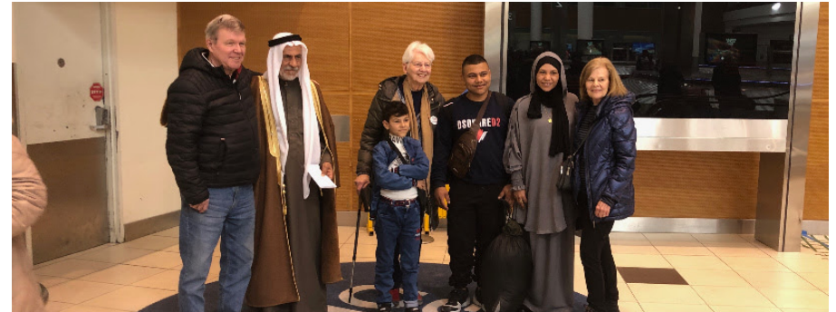
Gloria Dei (with CREST) welcomed a new family on March 25 th !

( https://ccrweb.ca/en/refugee-rights-day )